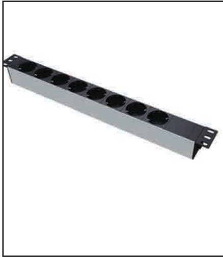
PDU - 19" 1U Standart

Anodized aluminium profile body 16 A, 250 V AC (50-60 Hz) Maximum power 3500 W Earthing contact socket outlet (German type) Socket inserts set at 45° 2 mt. 3x1,5 mm 2 , earthed cord, black IP 20