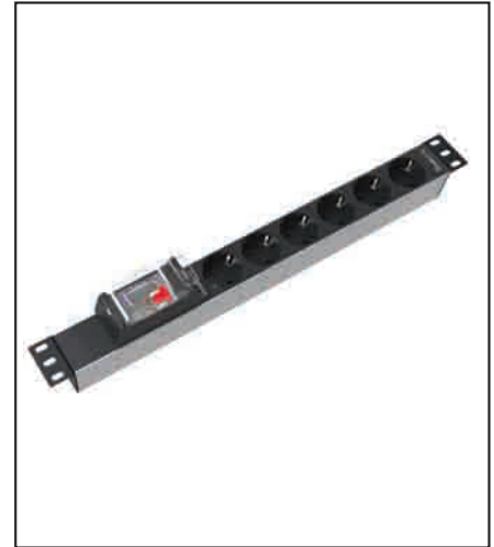
PDU - 19" 1U Powermeter (kWh Active Energy) Miniature Circuit Breaker (MCB) (1P)

Anodized aluminium profile body 16 A, 250 V AC (50-60 Hz) Maximum power 3500 W Earthing contact socket outlets (German type) Powermeter (kWh Active Energy) Miniature Circuit Breaker (MCB) (1P) Socket inserts set at 45° 2 mt. 3x1,5 mm 2 , earthed cord, black IP 20