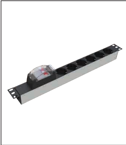
PDU - 19" 1U Miniature Circuit Breaker (MCB) (2P)

Anodized aluminium profile body 16 A, 250 V AC (50-60 Hz) Maximum power 3500 W Earthing contact socket outlets (German type) Miniature Circuit Breaker (MCB) (2P) Socket inserts set at 45° 2 mt. 3x1,5 mm 2 , earthed cord, black IP 20